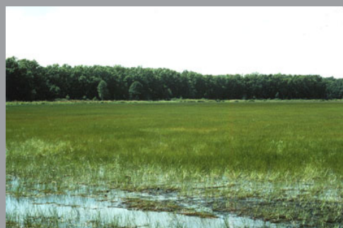
High water level, Goose Lake, 1990