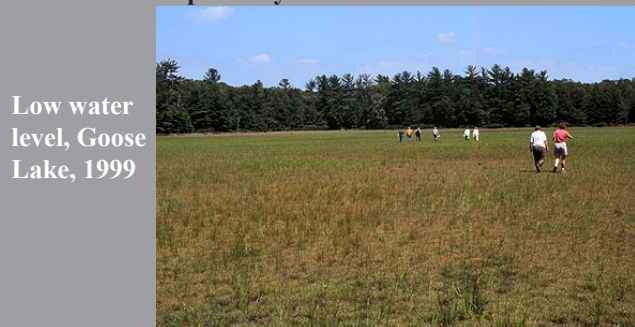
Low water level, Goose Lake, 1999